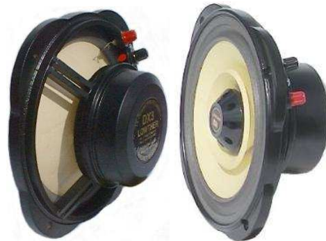
Lowther 8 in drivers

The Lowther DX series tends to sound a bit warmer and more midrange-forward than the classic Lowther sound. For most people that makes them easier to listen to. Of the DX series, the DX3 is the best compromise between performance and price. With a powerful magnet rated at 2 Tesla and excellent 98dB sensitivity, the DX3 is a stellar performer and possibly the best value for money in the entire Lowther line. On the other hand, DX4 is probably the best full range driver currently produced. Many people describe it as providing the best of both worlds: Alnico magic coupled with the Neodymium's power and low weight keeps them performing for a long time.