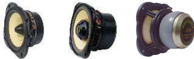
Lowther 5 in. drivers

The Magus family's latest addition is a model based on A55 (Alnico) drivers. Alnico or AlNiCo magnets are largely comprised of Al uminum, Ni ckel, Co balt, and Iron, with trace amounts of other elements used to tailor the alloy's magnetic and mechanical properties.